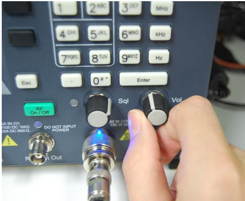
Figure 6-2. Adjust analyzer volume until about 4 kHz deviation is measured.