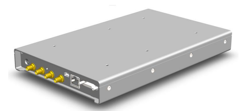
Figure 1: Embedded Chassis

ThinkRF typically provides the PCBAs within a chassis that is actively cooled by redundant blower fans. Cooling is achieved in that the receiver/digitizer PCBA is mounted and thermally connected to a machined heat-spreader. The heat-spreader is then cooled by air-convection via the fans in a manner such that the moving air does not enter the inside of the chassis.